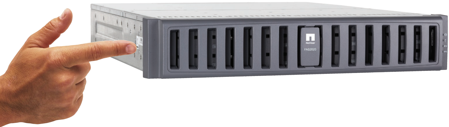
Figure 1) FAS2020 system.