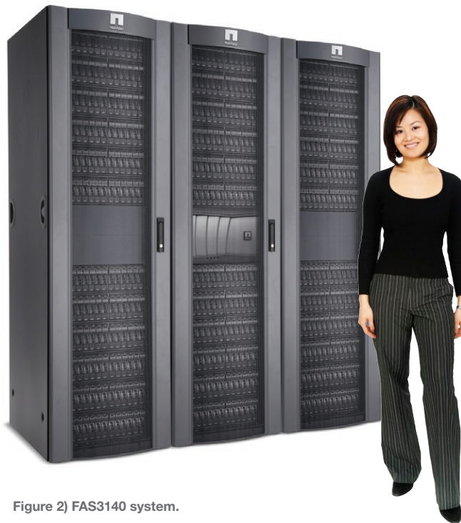
Figure 2) FAS3140 system.

Snapshot technology to provide you with incremental block-level synchronous and asynchronous replication. SnapVault®, in contrast, uses our Snapshot technology to perform block-level incremental backups of your data to another system. You can be assured of consistent backup images and application-level recovery in minutes when you use our host-based SnapManager® software, which integrates Snapshot management with your applications.