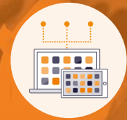
Apps & Data